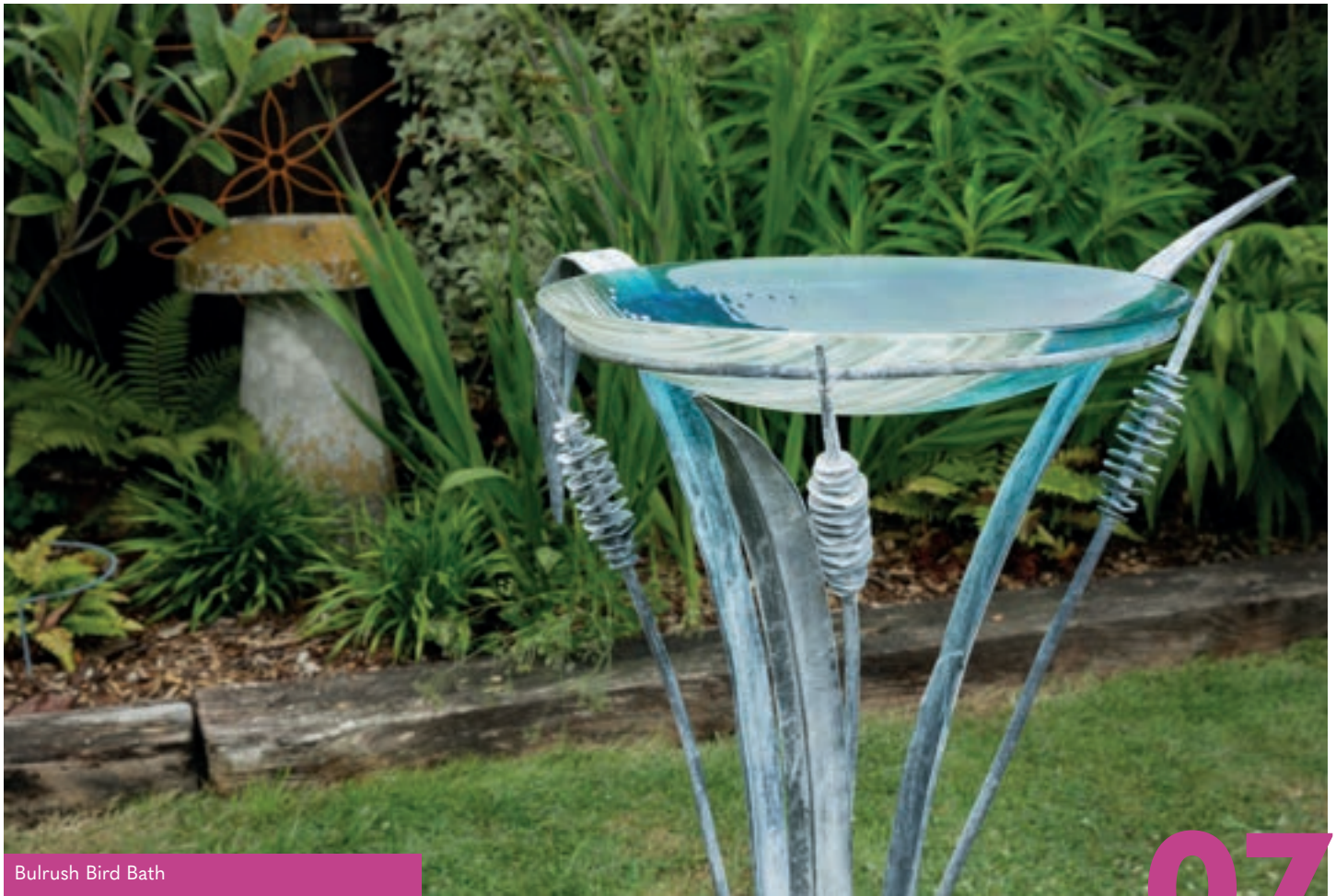
Bulrush Bird Bath